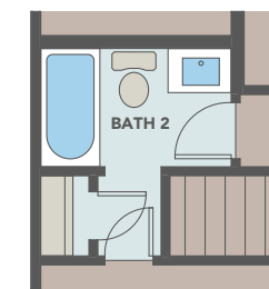
Opt. Bath 2 with Linen Door