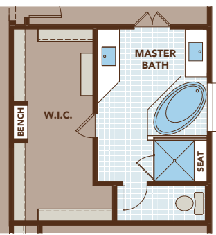
Opt. Drop-in Tub