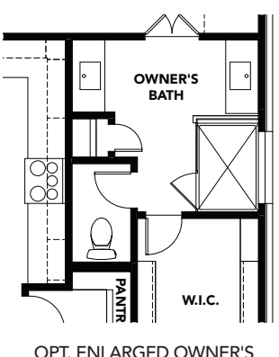
OPT. ENLARGED OWNER'S SHOWER