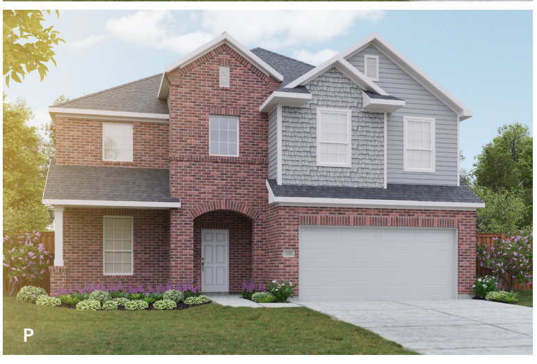
2-Tone Exterior Paint Package is Included. M, O & P Elevations are Shown with Upgraded 3-Tone Exterior Paint Package.