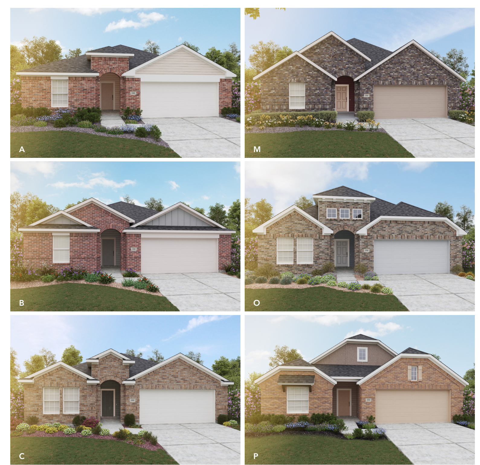
2-Tone Exterior Paint Package is Included. M, O & P Elevations are Shown with Upgraded 3-Tone Exterior Paint Package.