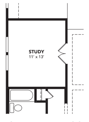
OPT. STUDY AT BEDROOM 4